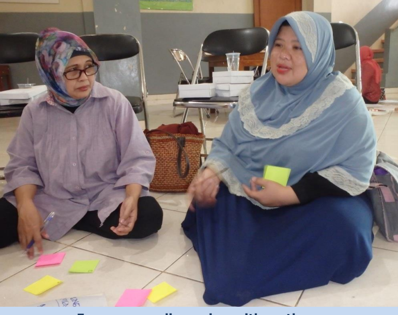
Focus group discussion with mothers