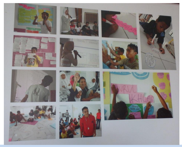
Child led research supported by Save the Children 2007 to 2008

on care, and piloting of the National Standards of Care to ensure gatekeeping and increased care of children in families.