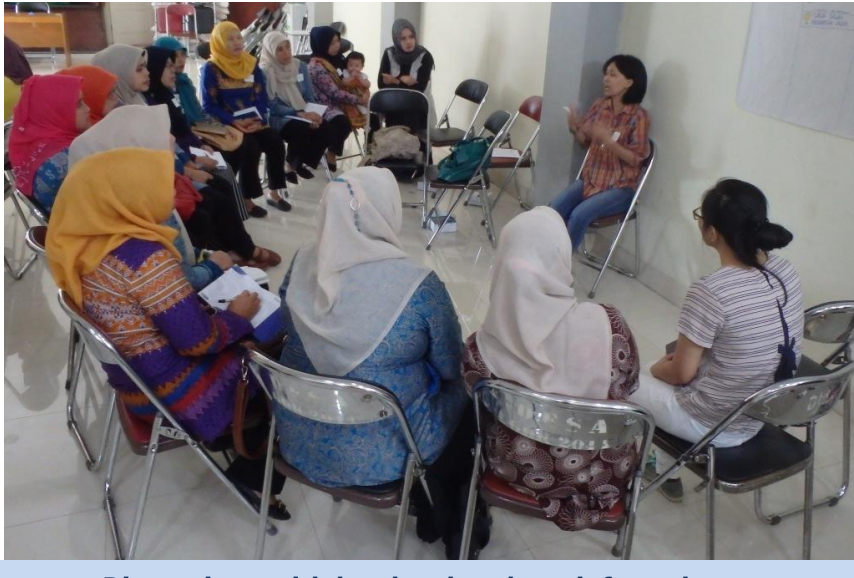
Discussions with local cadre about informal care