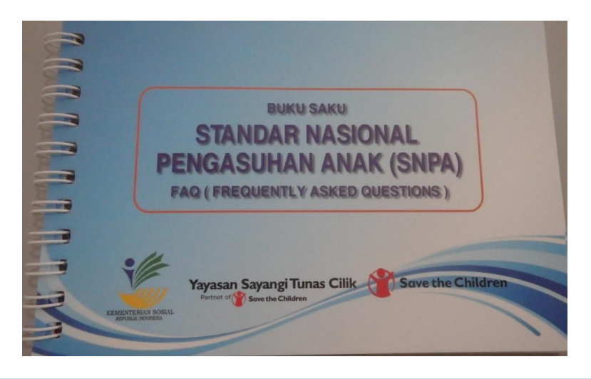
Pocket book of National Standards of Care