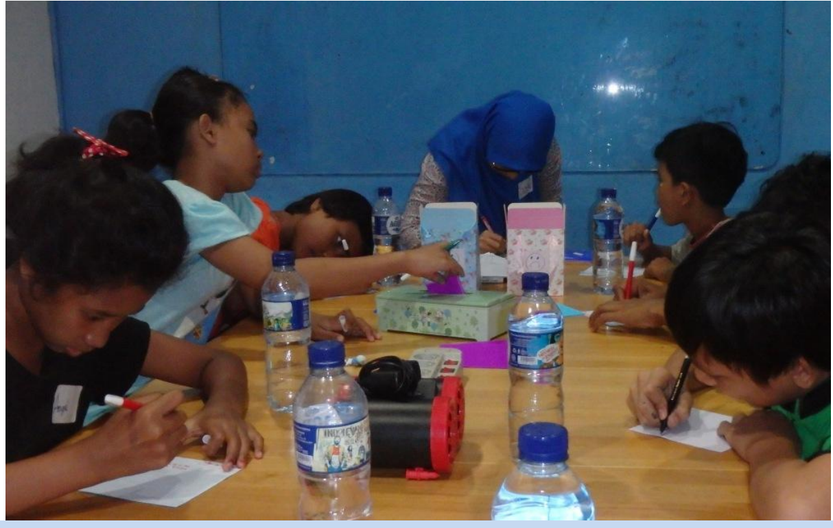
Consultation with children

to raise their concerns, to receive counselling and to refer children to relevant services.