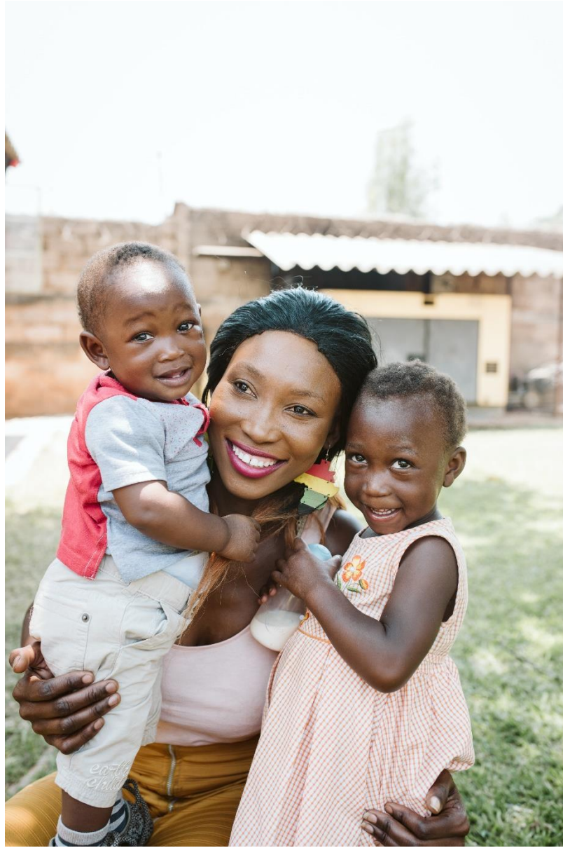
Photography of reunified families through direct programming