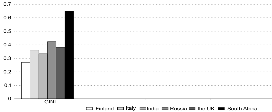
Figure 2 Gini index in the project countries