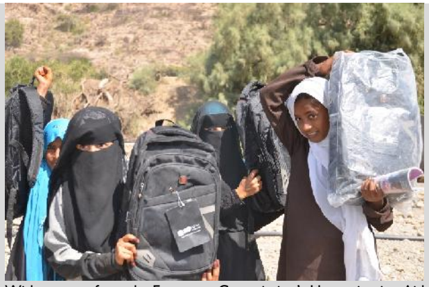
With support from the European Commission's Humanitarian Aid and Civil Protection Department, more than a hundred students between the first and third grades received Back to School kits in Kadan village in Lahj Governorate in January 2017.