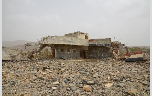
Al-Muzat School in Hajjah Governorate

bombardments and ground attacks has also resulted in parents often choosing to keep their children at home.