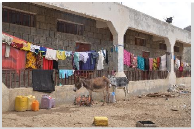
Rabua Al Kiery school in Lahj Governorate is being used by families forced to flee their homes because of the conflict. As a result, over 800 primary and secondary level students cannot use the school facilities. Some of them are currently studying in three temporarily learning spaces (tents) which are not enough to accommodate all of them; the rest of the classes take place under the trees. The closest functioning school is about one hour by feet.

shelter in public buildings, including schools, putting them out of action completely or forcing IDPs and students to share facilities. Today, 143 schools are being used as shelter by IDPs.<sup>19</sup> An example, includes a school in Al Madaribah District in Lahj Governorate, where the entire school premises is being used by IDPs as shelter, and those students still attending have to either study in the building's hallways or the school playground where other IDPs have also pitched tents.<sup>20</sup>