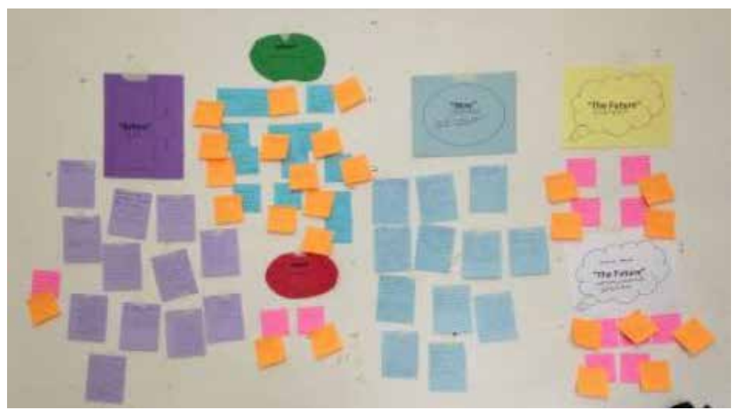
Participatory activity with GBV practitioners - Capacity on disability inclusion "Before", "Now" and "The future."