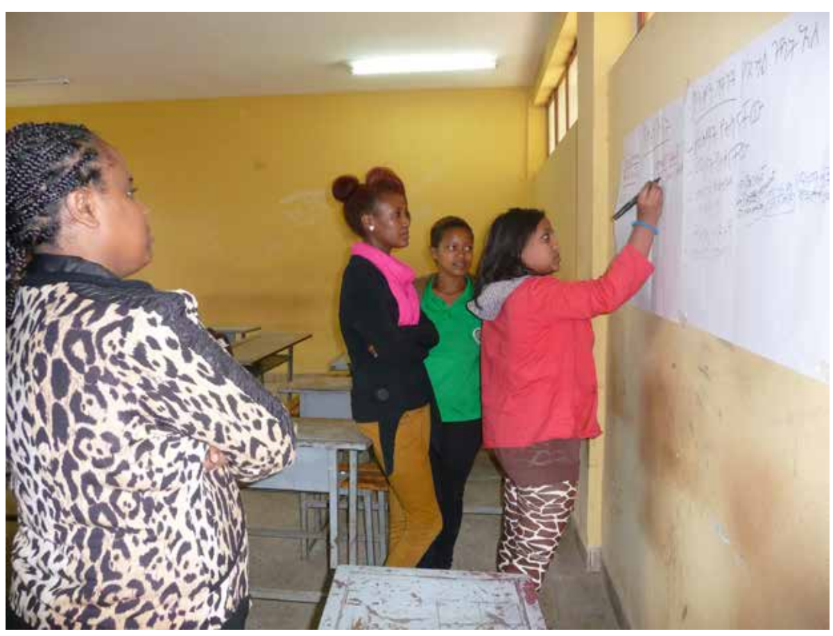
Group discussions with young women who are caregivers of persons with disabilities, and mothers of children with disabilities.

One way in which children and youth with disabilities could contribute to our community-based activities (for example, the girls who are blind could run a class with the other girls on how to guide blind persons).