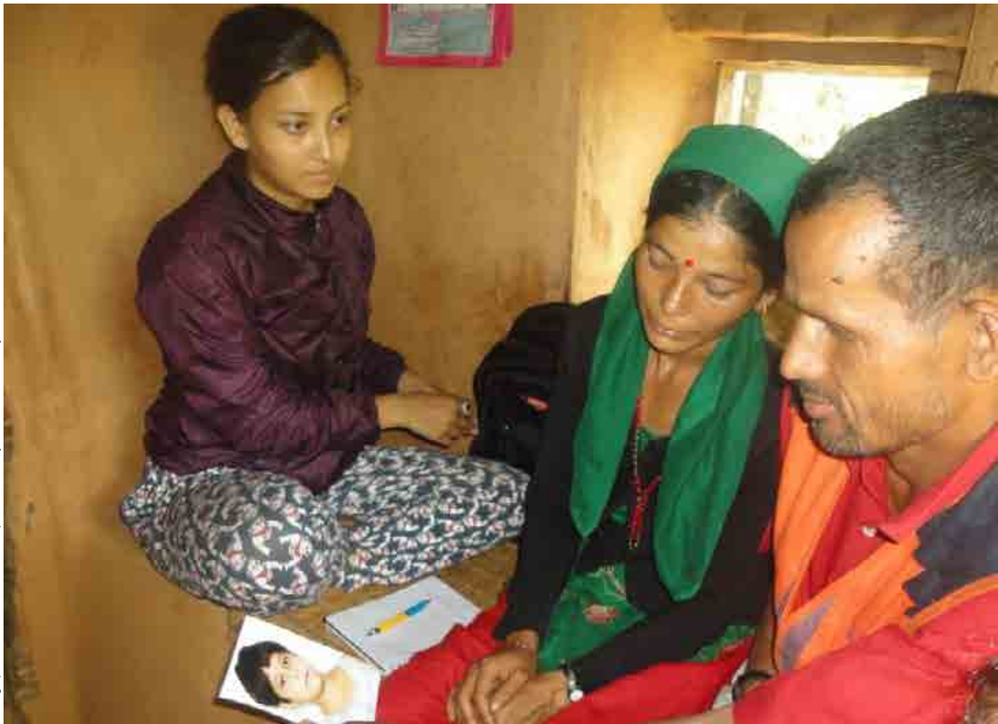
An NGN/THIS social worker (left) shows a photograph of a displaced girl, who was rescued from an exploitative orphanage, to a family as part of the family tracing and reintegration process.

districts and sometimes involve a tough physical journey; social workers may need to walk long distances, sometimes for several days in a row. For safety reasons, NGN and THIS recommend that two social workers go on these journeys together or that a lone social worker is joined by a field assistant. Porters and guides should also be hired where necessary. Social workers sometimes risk their own lives to find the families of children. Therefore, all efforts should be made to protect their welfare whilst working on such cases, for example, by taking out medical and accident insurance in their names.