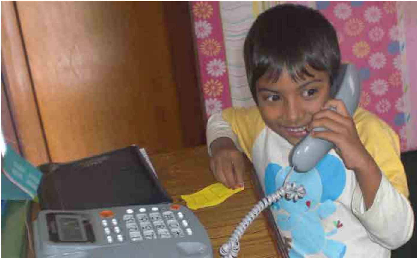
A remote reconnection: A displaced child located at the NGN/THIS transit home is able to talk to her family for the first time in years.

communication the family has had in years. This telephone call alone can break down tough emotional barriers between the parents, social worker and child.