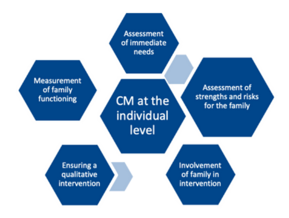
Section 3: Measurement of CM in child protection