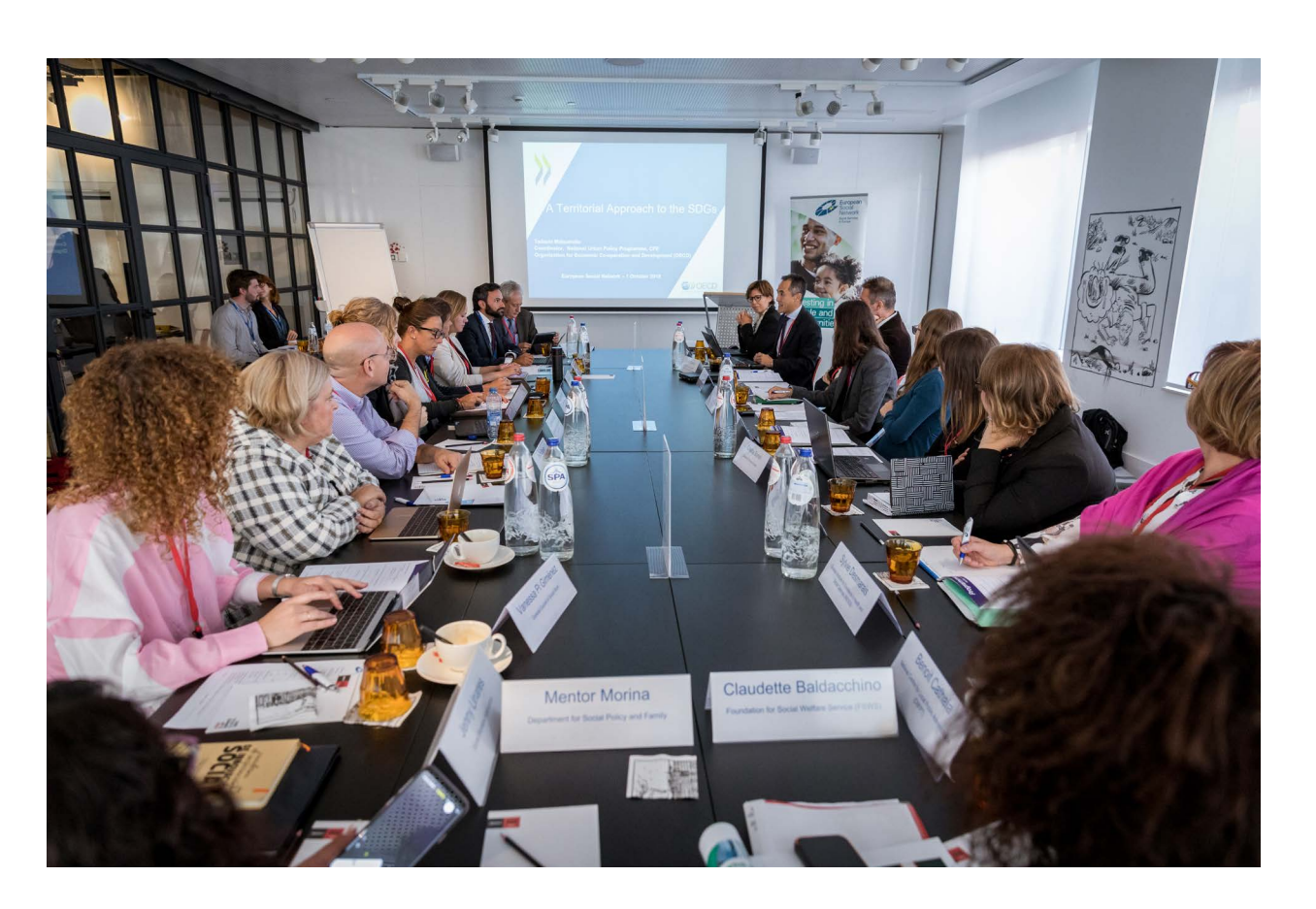
ESN's working group on the implementation of the Sustainable Development Goals

The global agenda of the Sustainable Development Goals (SDGs) provides social services an opportunity to emphasise their role related to people's empowerment, upholding human rights, social justice, promoting social inclusion, and social development and investment. The global agenda enhances this possibility as the SDGs have a series of similarities in relevance and application with social services practice. However, we have also identified a number of challenges as social services authorities and agencies are not always part of cross-cutting initiatives adopted to implement the sustainable agenda at national and local levels.