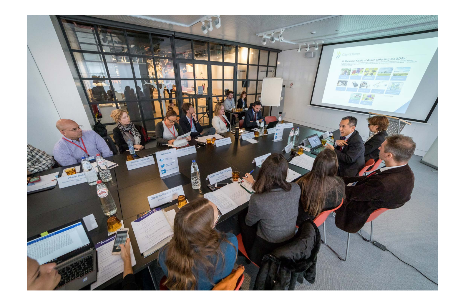
ESN's working group on the implementation of the Sustainable Development Goals

These platforms can act as a space where participants can share and exchange good practice examples from all levels on the SDGs implementation in order to inform local and regional decision-makers about the benefits and opportunities pursuing the sustainable development agenda, how this agenda relates to local practice, and which tools are necessary to effectively contribute to its implementation.