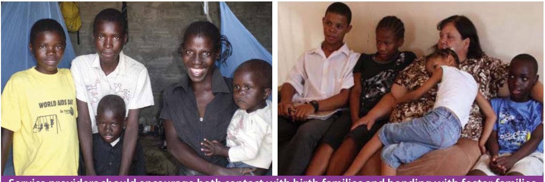
Service providers should encourage both contact with birth families and bonding with foster families