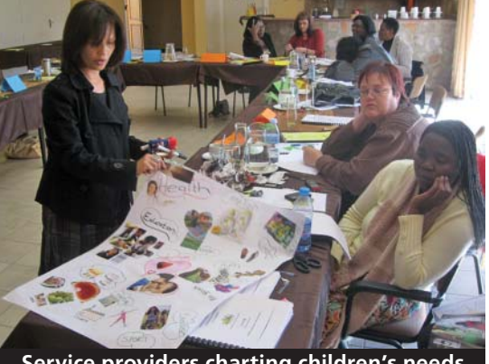
Service providers charting children's needs