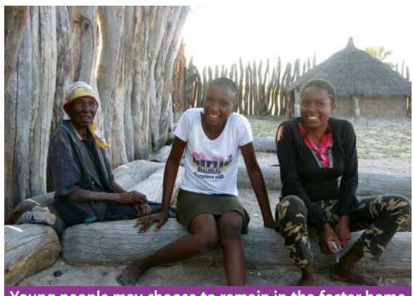
Young people may choose to remain in the foster home