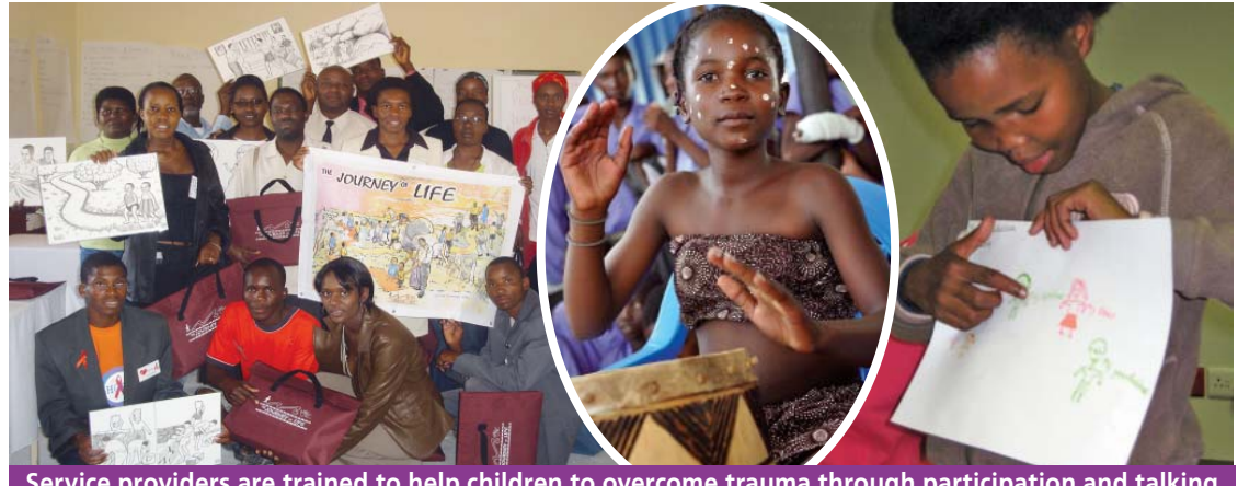
Service providers are trained to help children to overcome trauma through participation and talking