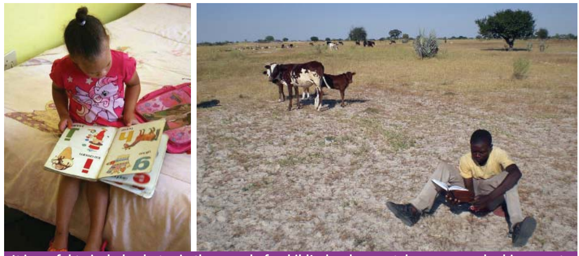
It is useful to include photos in the record of a child's developmental progress and achievements