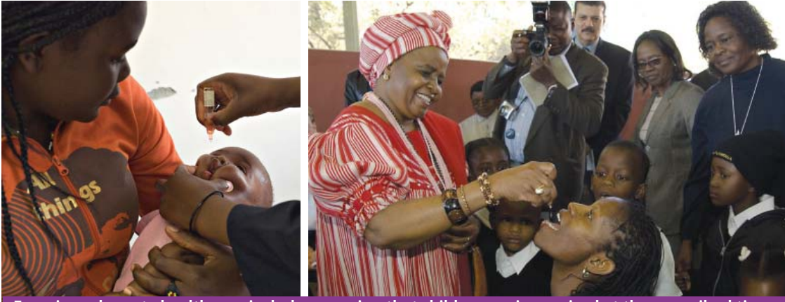
Ensuring adequate health care includes ensuring that children are immunised at the prescribed times