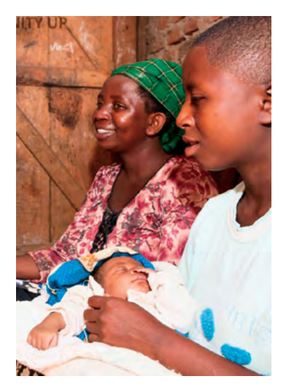
Through the SUNRISE program in Uganda, a teen mom is supported by her family and community to stay in school.

concerns in 2016 appear to be the sector being poorly resourced; poor assessment of workforce needs and planning for the workforce; and poor work conditions and facilities. Comparing the 2010 and 2016 responses, the increase in the number of countries identifying poor assessment of workforce needs may reflect a growing awareness of the importance of human resource data as a foundational aspect of workforce planning. The decrease in the number of countries identifying low knowledge and skills and lack of clarity in roles as top challenges may represent positive shifts in access to training.