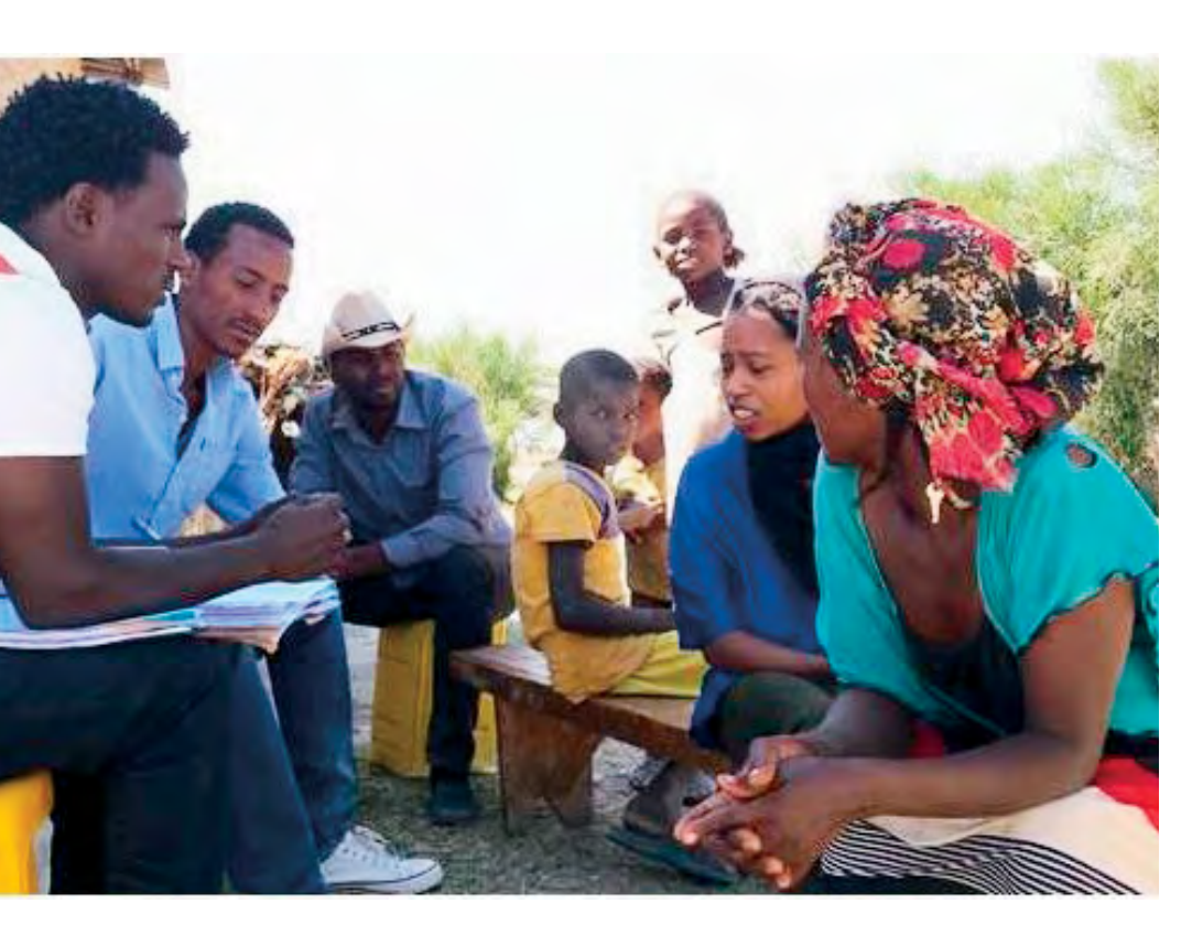
Social workers visit a family as part of a pilot project to enhance access to basic services.

deployed in the justice sector, particularly in the Amhara and Somali regions. In Malawi, in-service training was provided for field placement instructors and for para professionals who attended the REPSSI distance learning course. In Mozambique, PEPFAR/USAID funded short-term training in 2014 for 52 public servants on strategic human resource management; planning and budgeting; assets management; budget management and auditing; and monitoring and evaluation. In South Africa, ongoing professional development is required in order to maintain registration with SACSSP and DSD began an accredited professional development program