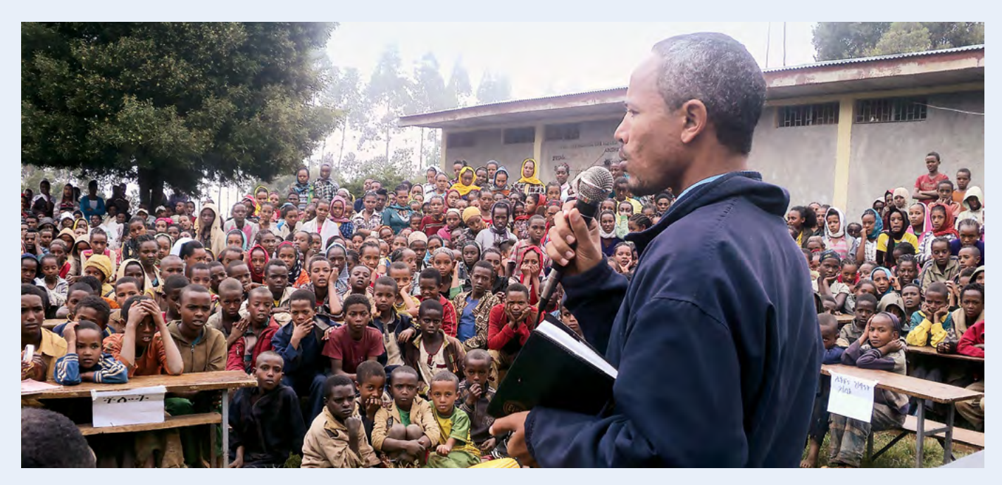
A social service worker talks to school children about the dangers of life on the street.

At times when an individualized approach to providing care seems most appropriate, effective case management and referral mechanisms rely upon the smooth interaction and collaboration among different cadres of the social service workforce, whether at the community, district or national level and whether engaged by civil society and NGOs or government. Community-based workers, often linked with a civil society organization or NGO, when faced with statutory issues such as concerns involving child sexual abuse, need links to district-level government officers to refer cases. Workers and families also benefit when clear linkages are established with other service providers, such as for health referrals, enrollment in school, cash transfers or social protection programs, economic household strengthening programs and positive parenting programs.