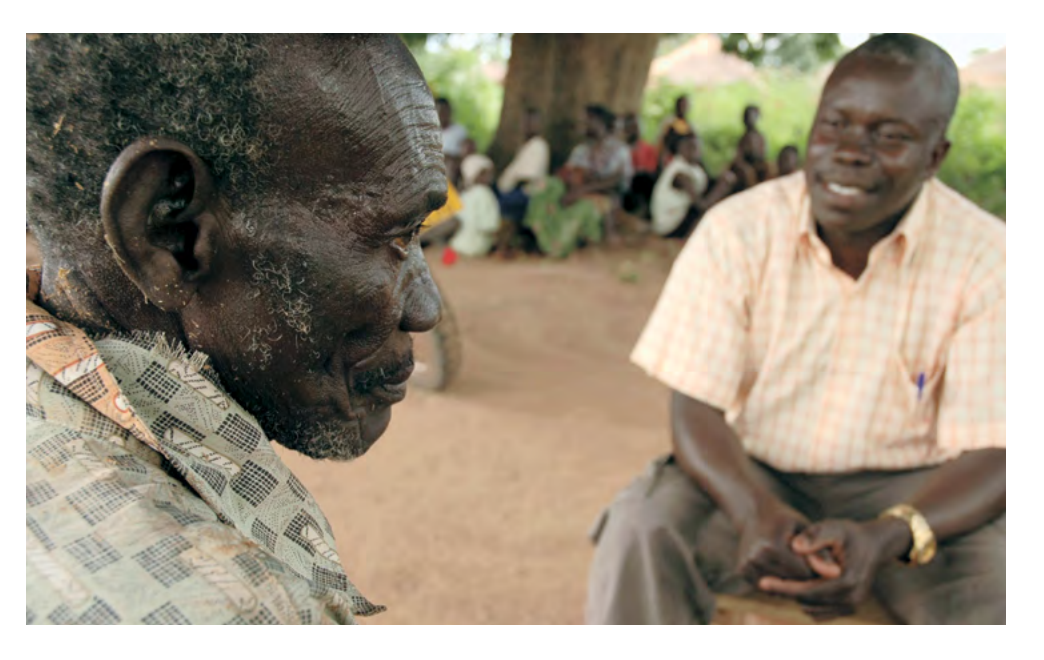
Assessment in the community.