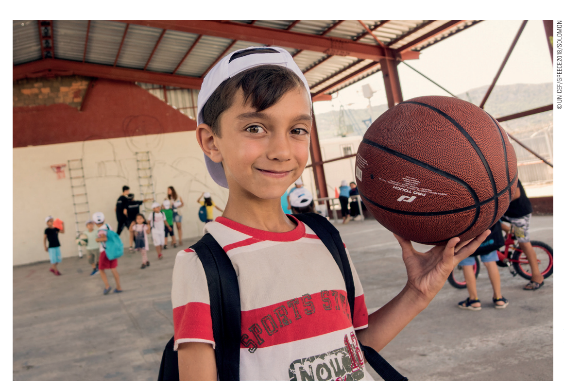
A boy in Skaramagkas Open Accomodation Site in Athens, Greece during a UNICEF event celebrating International Day of Friendship.