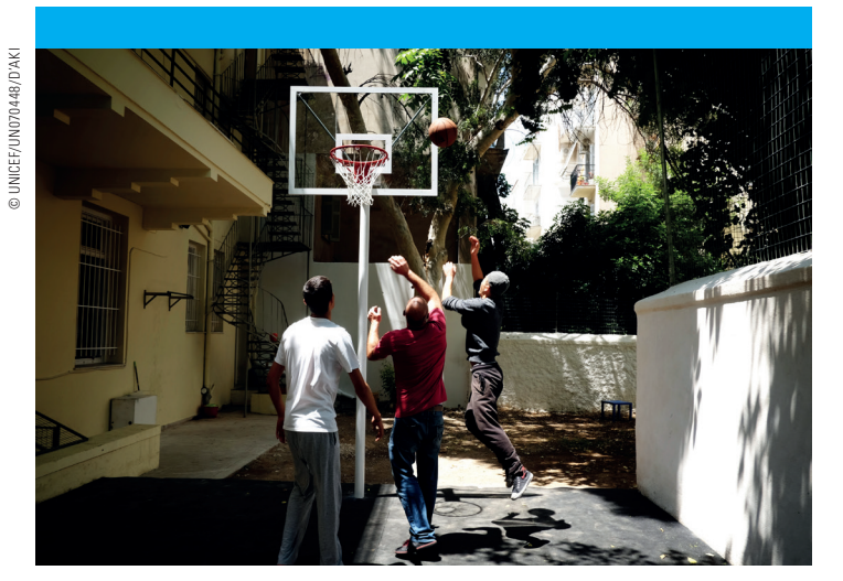
Unaccompanied children from Afghanistan and Algeria play basketball with an employee in the courtyard of the SOS Children's Villages shelter, a UNICEF-partner which receives funding from the European Union Civil Protection and Humanitarian Aid Operations, Athens, Greece. As of November 2018, Greece is host to an estimated 25,700 refugee and migrant children, of whom 3,800 are unaccompanied children.