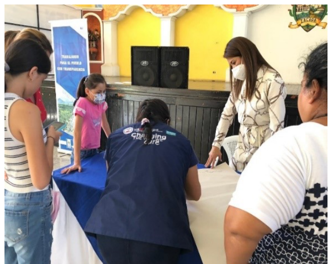
Parents sign up for parenting classes organized by OMNA.

CTWWC worked with government to strengthen their capacity to support children and families, through advocacy, coordination, building capacity of the workforce, and supporting development of